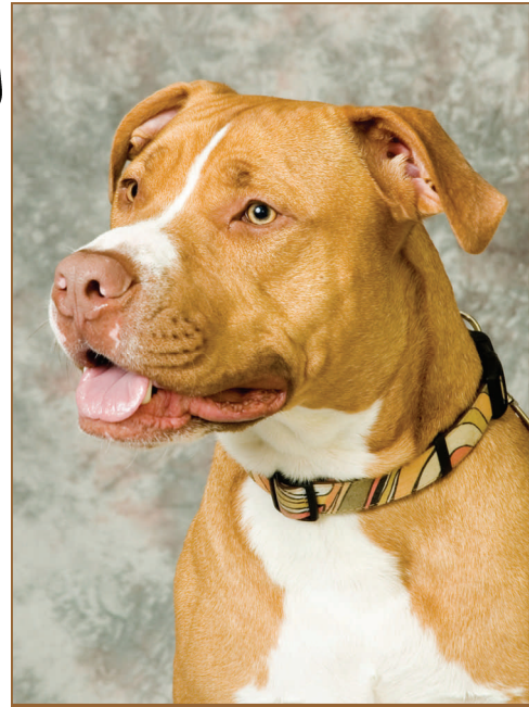
Houston is available for adoption

Hopeful Hearts Rescue will be in attendance as well! www.hopefulhearts.ca